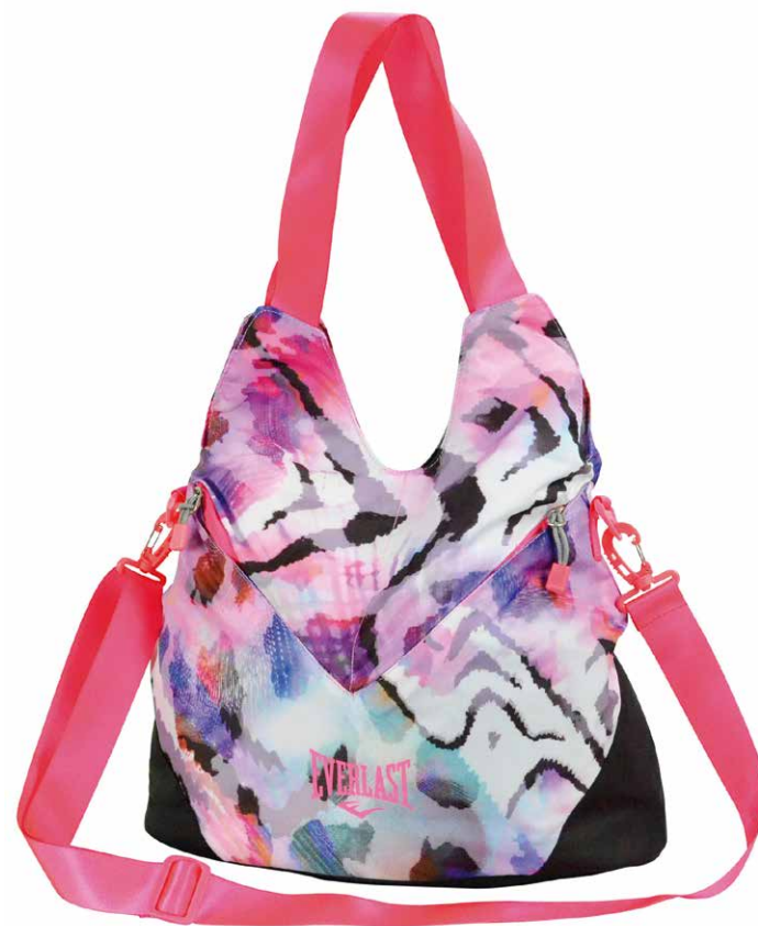
RANDOM SHOULDER BAG